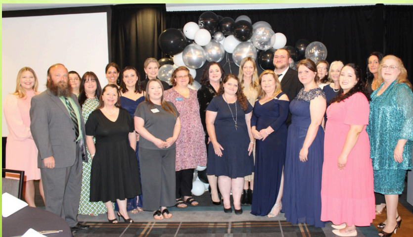
East 3 & 4