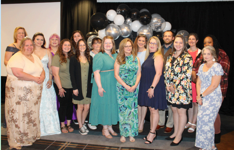
Central 5 & 6