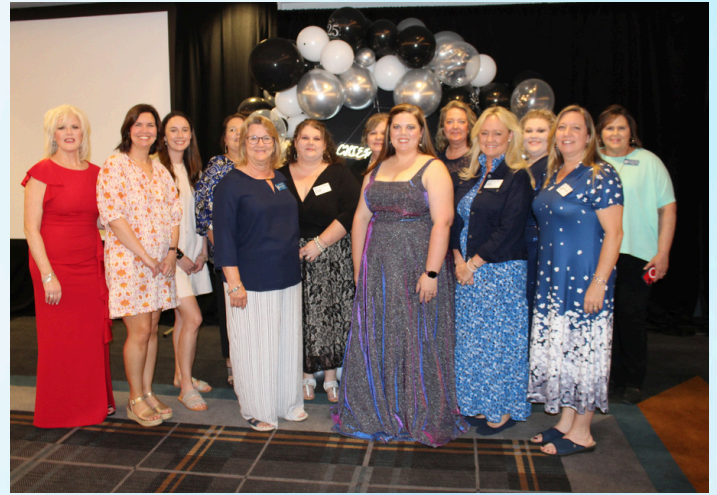
West 7 & 8