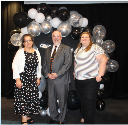
Central 1 & 2