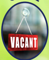
Position Currently Vacant