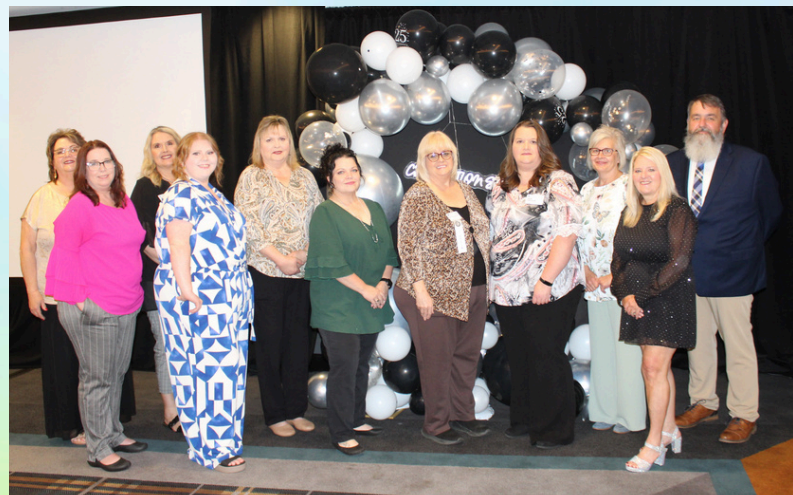
East 5 & 6