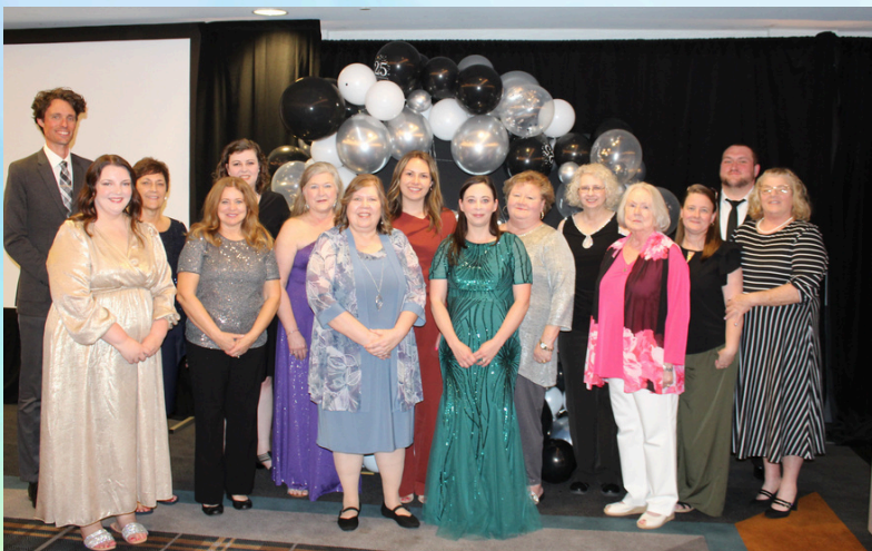
East 1 & 2