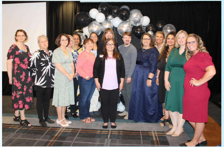
Central 3 & 4