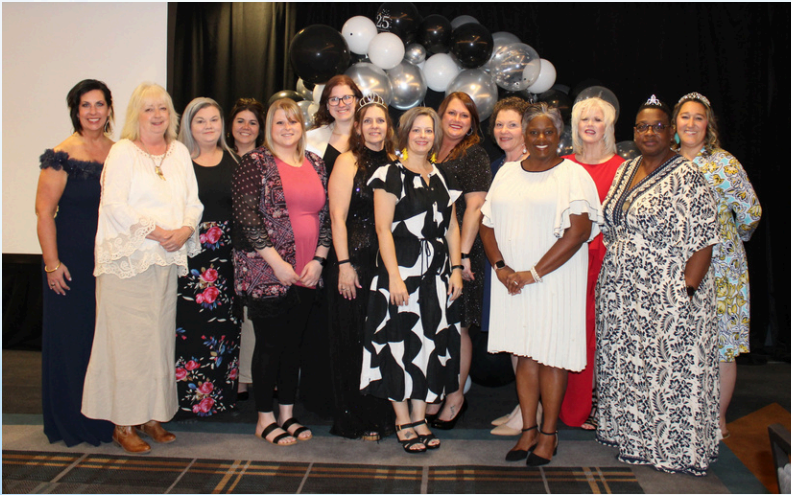
West 5 & 6