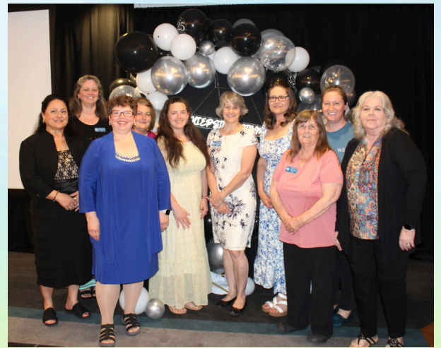
Central 7 & 8