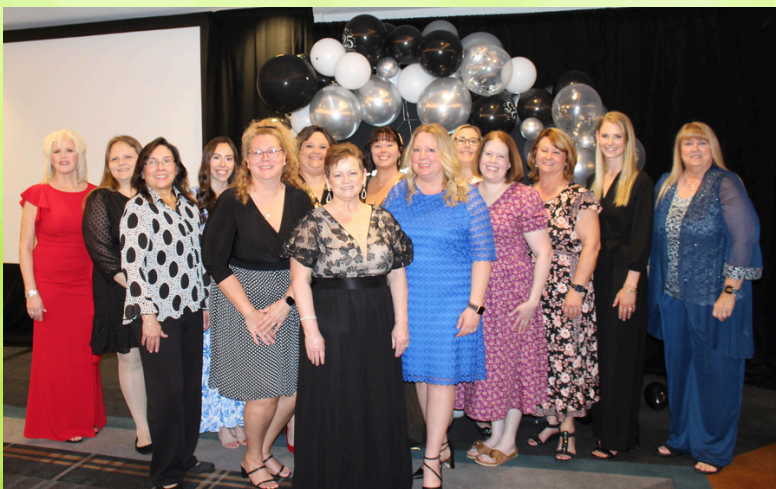
West 1 & 2