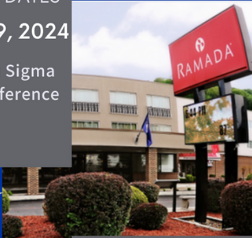
RAMADA INN PAINTSVILLE, KY

Information about our annual conference will go out to enrolled members in February/March. Please note that conference registration is separate from membership enrollment. Both will be covered by professional improvement funds with AED approval. If you have any questions, please reach out to any member of the board or join our Q&A Zoom.